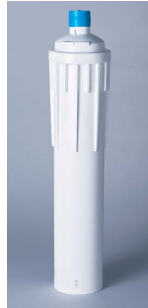
15" cartridge (XL)

Permanent filter heads with replaceable cartridge elements for high flow and high capacity to 20,000 gallons. Rated for temperatures to 100°F and 125 psi. Some product codes are NSF certified.