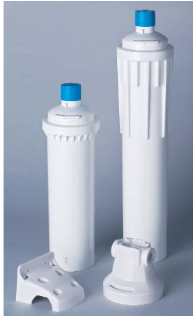
Elf filters, head and bracket