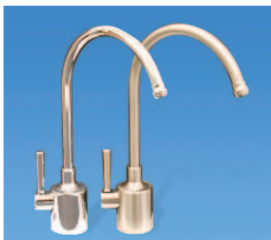
Top mounted faucets (in chrome & nickel)